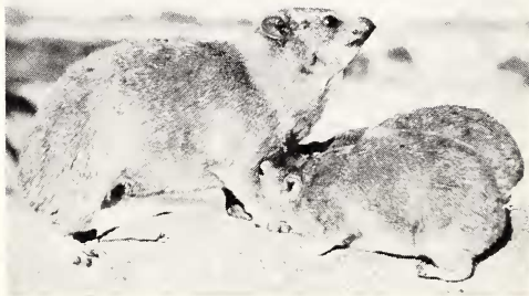
Fig. 1. two infants (about 3 months old) of P. johnstoni suckling from the pectoral teats. The fur in front of the dam's hind legs is disordered where the infants suck from the inguinal teats

Teat constancy is known in pigs (NACHTSHEIM 1925; DONALD 1937; HÖPLER 1943; BURGHARDT 1957; MCBRIDE 1963), cats (EWER 1960; ROSENBLATT 1972) and rats (BONATH 1972), all altricial mammals. Hyraxes are precocial, bearing fully developed young after a gestation period of approximately 7½ month (ROCHE 1962; MENDELSSOHN 1965; SALE 1965 a, b). The Rock hyrax P. johnstoni and the Bush hyrax H. brucei were observed in the Serengeti National Park, Tanzania, for 30 month. Most animals were marked. Hyraxes are the most characteristic resident mammals of the rock outcrops (kopjes), living in family groups consisting of an adult ♂, several adult ♀♀ and juveniles of both sexes. ♀♀ within a group have synchronized birth (1—4 young observed) and are genetically related (HOECK, in prep.).